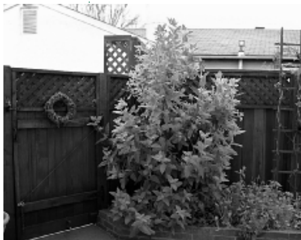
Fresh growth of pitcher sage ( Lepechinia fragrans ), miner's lettuce ( Claytonia perfoliata ), and trellised chaparral clematis ( Clematis lasiantha ) during the winter season. Keboe garden, Sunnyvale, CA.