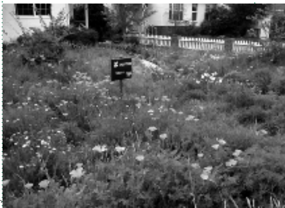
Early spring colors in a meadow: California poppy, blue flax, yarrow, purple Pacific Coast Hybrid iris, and flowering branches of western redbud. Sunnyvale, CA.

Remove (deadhead) spent flowers on buckwheats ( Eriogonum sp.), coyote mint ( Monardella sp.), penstemon, hummingbird sage ( Salvia spathacea ), yarrow ( Achillea millefolium ).