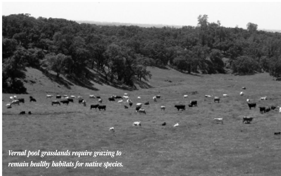
Vernal pool grasslands require grazing to remain healthy habitats for native species.