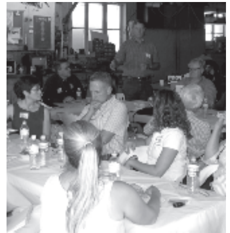
California environmentalists and ranchers exchange views at August 2005 summit.

Following the August summit, the newly formed coalition of conservationists—both