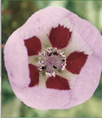
Desert five-spot brightens the desert with its magenta markings.

On Thursday we drove east along I-40 to explore the Clipper Mountains, first from the north (via a mine road accessed from Essex Road north of I-40), where we spent the morning “botanizing.” Then we drove south on Essex Road, but we had to stop because we discovered a multi-acre area where desert lilies ( Hespercallis undulate ) abound: thousands of flower