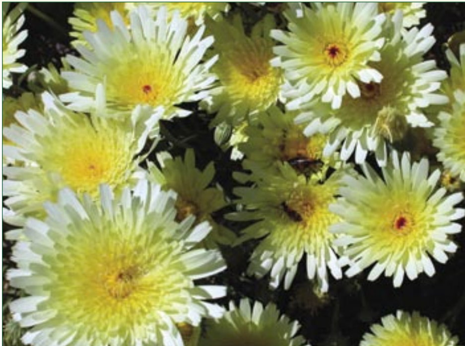
A close-up of desert dandelion flowers.

P. recurvata ; Cryptantha angustifolia , C. barbigerata , C. dumetorum , C. maritima , and C. nevadensis ; Chaenactis carphoclinia , C. fremontii , and C. stevioides ; Camissonia brevipes , C. claviformis , and C. refracta ; and Chorizanthe brevicornu , C. corrugata , and C. rigida . In a shady spot among the rocks we found the hairy fern Cheilanthes parryi . We encountered new aster species Tricophilium incisum , Prenanthebella exigua , and Senecio mohavensis .