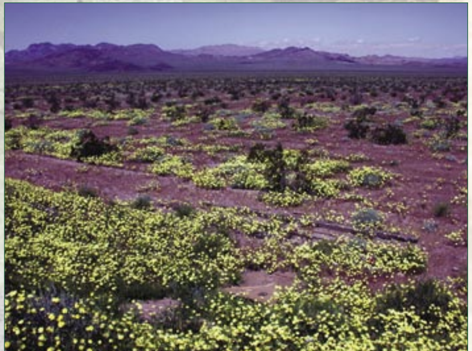
Desert dandelions covered the desert washes north of Ludlow.