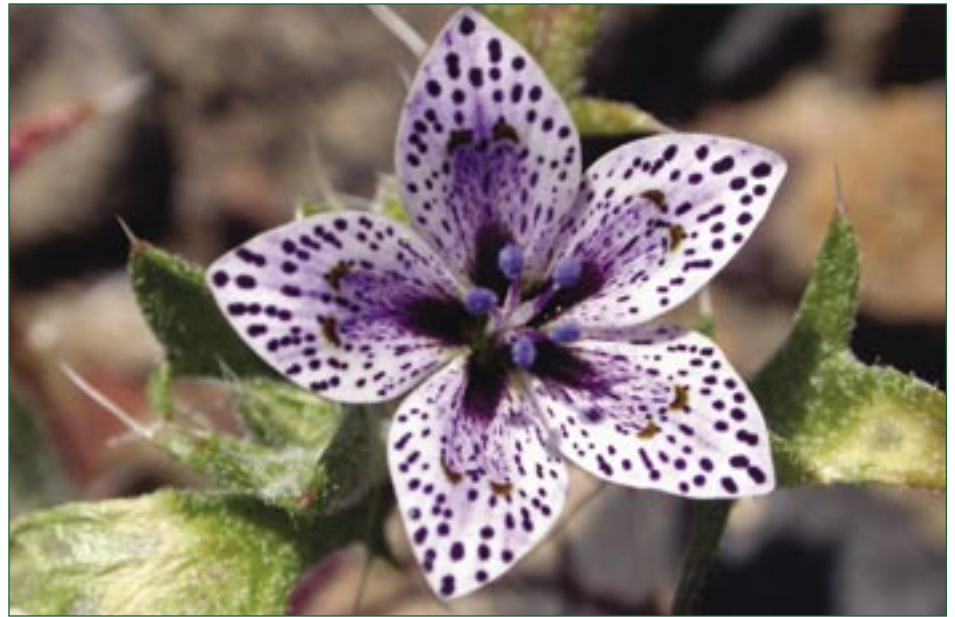
Lilac sunbonnets bloomed in profusion this year.