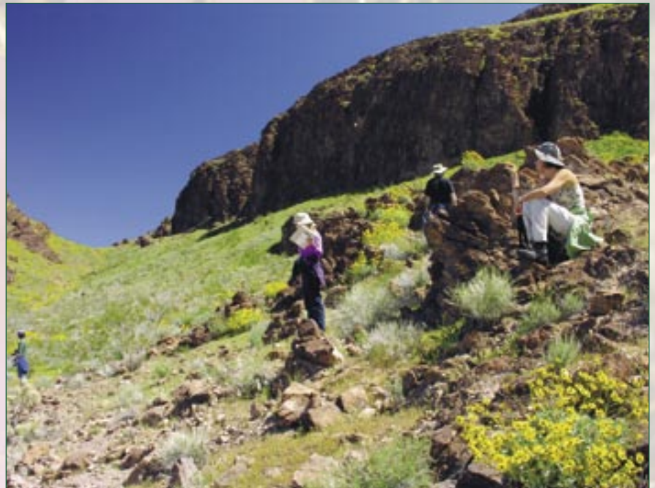
CNPS desert enthusiasts enjoy a spectacular spring.

fecta: We saw a Mojave green rattlesnake, a horned lizard, and a desert tortoise.