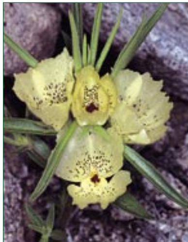
Ghost flower was abundant in the Dead Mountains.

drive up the rocky and sandy cherry-stem access into the heart of the Dead Mountains wilderness from the east side. We hiked around, up a rocky hill, and then back down through a splendid little wash where, on the north side of rocks and under shade, we found Parietaria hespera var. hespera , commonly called pellitory, a non-stinging member of the nettle family. We also found Pterostegia drymarioides (another shade lover), bristly langloisia ( Langloisia setosissima ssp. setosissima ), and ghost flower ( Mohavea confertiflora ).