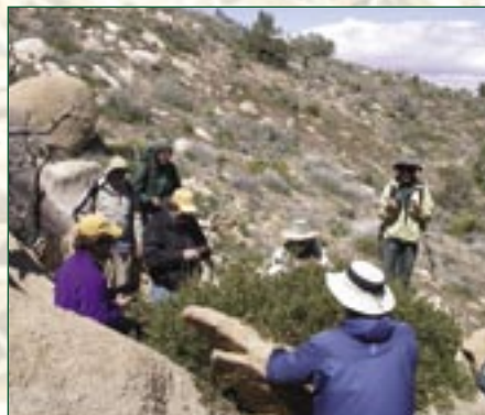
At 5700 feet in the Granite Mountains, CNPSers surround a rare manzanita shrub.

derpod ( Isomeris arborea ), and with many annuals. As we walked up rocky washlets leading to a sheer cliff, we encountered different species, including a variety of cacti. A small locoweed, Astragalus nuttallianus , covered the ground and made it look green when viewed from a distance (although a mix of native and non-native grasses could be found there as well). We saw 110 plant species in about two hours. And we scored a reptile tri-