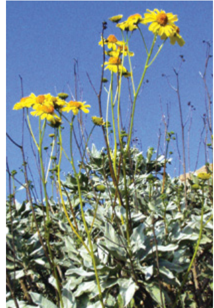
Encelia farinosa

When we began our Chapter newsletter several years ago, we wanted to name it for a plant that reminded us of our unique and spectacular "territory". We settled on Encelia farinosa because - well it's just us. It lives out with the wind, the heat, the rain, the rocks, the slopes, the flats, the washes. It sleeps in the summer and springs into action at first chance. It wears a distinctive suit of bark and leaves, in a silvered patina to rouse the envy of any well-fitted explorer. And when the hard times are over and it's time to shine, it holds every one of its golden yellow flowers high and clear, for all to enjoy.