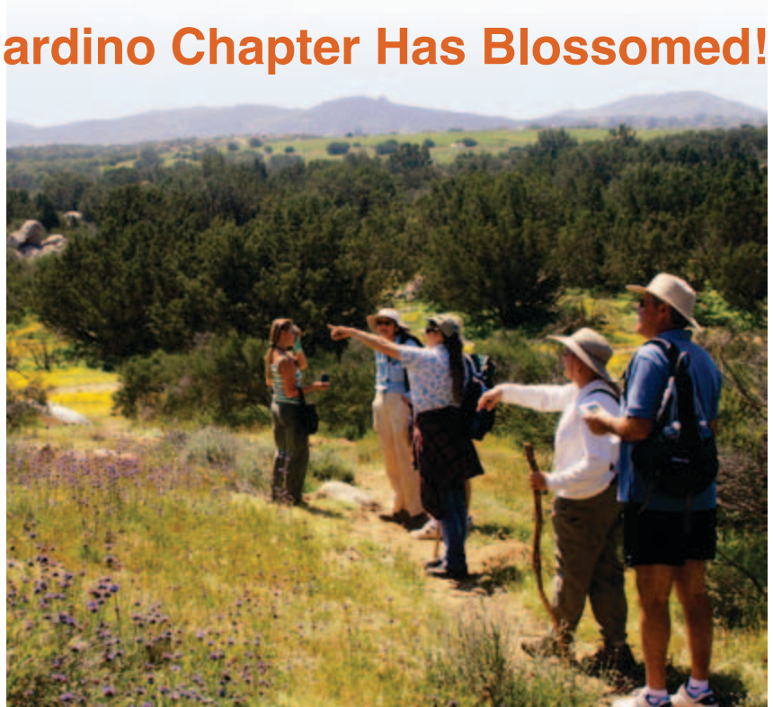
Searching for the elusive Chocolate lily at Harford Springs Riverside County Park. Find the Chocolate Lily in this publication.

We welcome you to join us at an upcoming hike, program or plant sale. To find local events: subscribe to our listserve, check our chapter website ( www.enceliaCNPS.org ), or contact one of our steering committee members (see back page for details). If you are interested in joining, learn about membership levels, benefits and discounts online or at a local event.